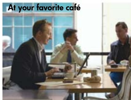
At your favorite café